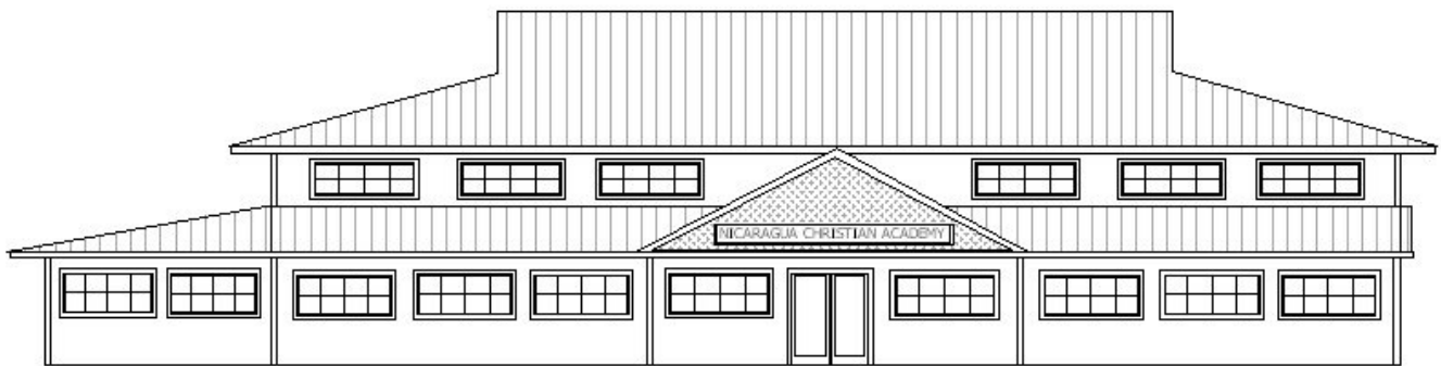
Frontal View of Fine Arts Center